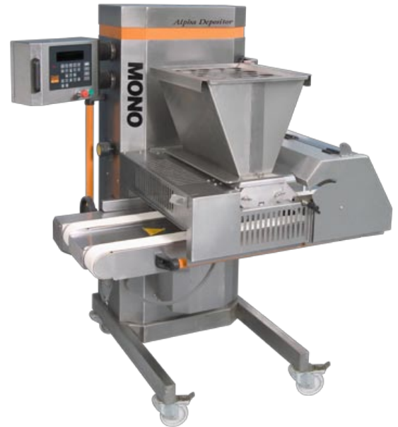
↑ Standard Alpha depositor