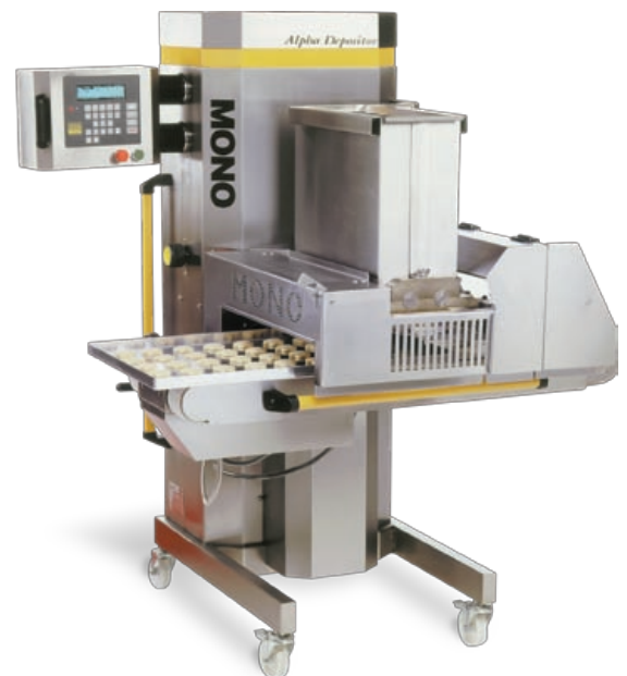
↙ Alpha depositor with wirecut option