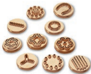
Italian cookie dies